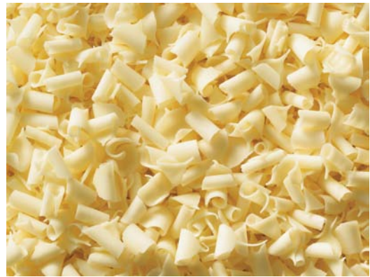
3772001 6/4 KL LUIJCKX CHOCOLATE WHITE BLOSM CURLS Mini white chocolate curls that can be used in decorating cakes, individual desserts, pastries, ice creams, etc. Made from Belgium chocolate from Callebaut.