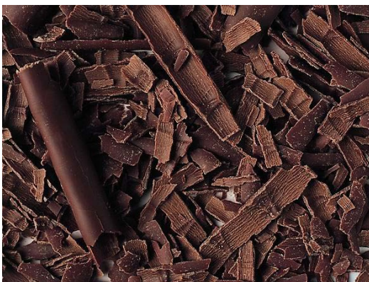
5777871 6/2.5KG LUIJCKX CHOCOLATE DARK SHAVINGS Very fine dark chocolate shavings for decorating the sides and tops of cakes, desserts and pastries. Ideal for Black Forrest cake.