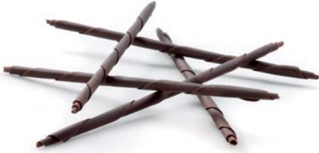
3704038 16/115CT LUIJCKX CHOCOLATE SHAPE CIGAR MAXI 8"

Great finishing pieces for any assortment of desserts, Ice Cream, shakes and much more Choose from our wide selection of shapes and colors made from Imported Belgium chocolate