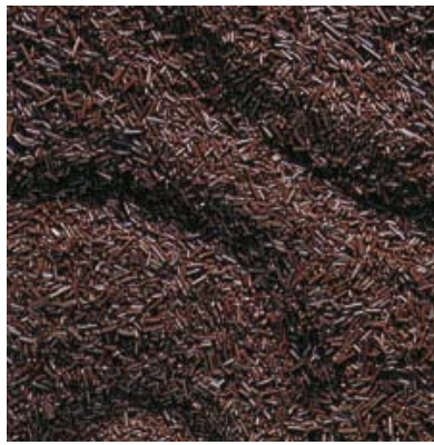
5938812 4/5KG CALLEBT SPRINKLE CHOC DARK VERMICELLI Dark chocolate sprinkles used on cakes, petit fours, pralines, ice cream and all kinds of baked pastries. Ready to use. Ingredients: Sugar, unsweetened chocolate, cocoa, dry whole milk and natural vanilla flavor.