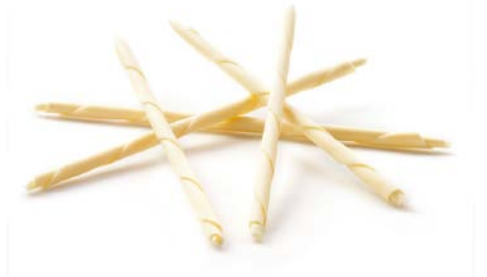
3709581 16/115CT LUIJCKX CHOCOLATE WHITE CIGAR MAXI 8"

8" White rolled cigarette made from white Belgium chocolate made from Callebaut. Can be snapped in half to make a smaller size. Can be used for decorating cakes, desserts, pastries, ice creams and more.