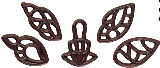
7631163 2/700 CT LUIJCKX CHOCOLATE DARK DECOR FIGUROLA

8" Dark chocolate cigarette made from dark Belgium chocolate made from Callebaut. Can be snapped in half to make a smaller size. Can be used for decorating cakes, desserts, pastries, ice creams and more.