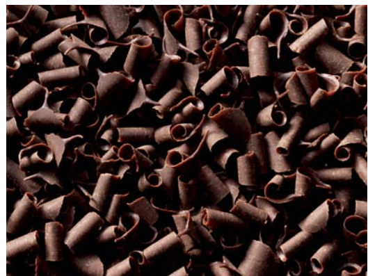
3714474 6/4 KL LUIJCKX CHOCOLATE DARK BLOSSOMS CURLS Mini dark chocolate curls that can be used in decorating cakes, individual desserts, pastries, ice creams, etc. Made from Belgium chocolate from Callebaut.