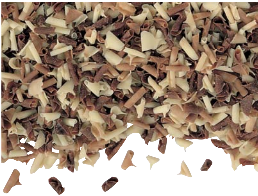
3771276 6/4 KL LUIJCKX CHOCOLATE MARBLED BLOSM CURL Mini marbled chocolate curls that can be used for decorating cakes, individual desserts, pastries and ice creams. Made with Belgium Chocolate from Callebaut.