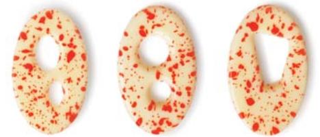
3792447 10/504CT LUIJCKX CHOCOLATE WHITE DECOR BARCELONA

8" White rolled cigarette made from white Belgium chocolate made from Callebaut. Can be snapped in half to make a smaller size. Can be used for decorating cakes, desserts, pastries, ice creams and more.